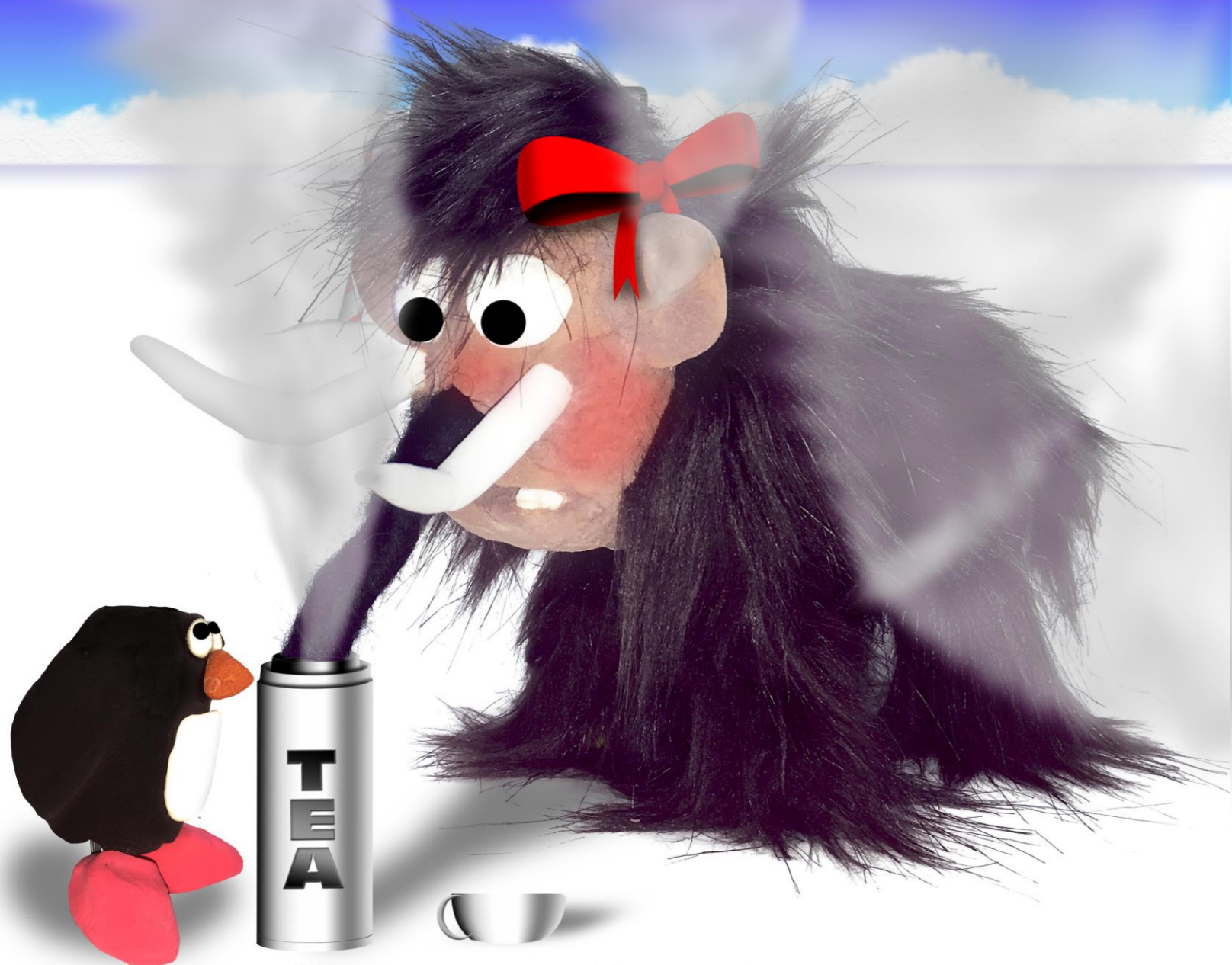
For thousands of years Woolina's been dreaming,