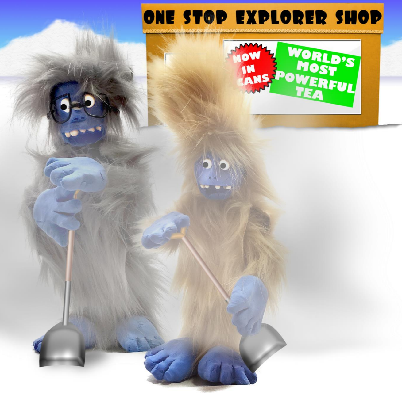
But after two cups her whole body's steaming.