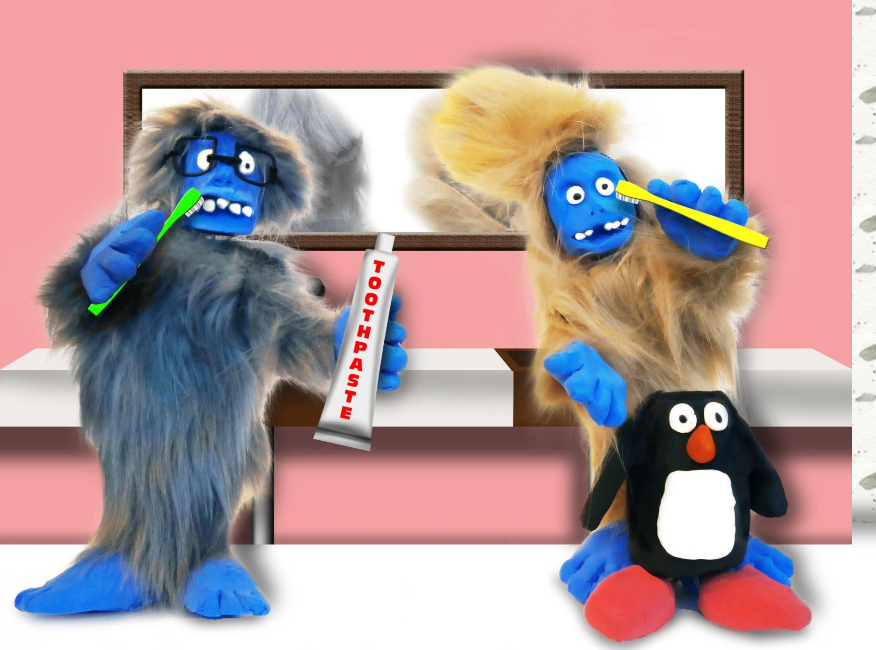
And when they're well fed, and have both brushed their teeth,